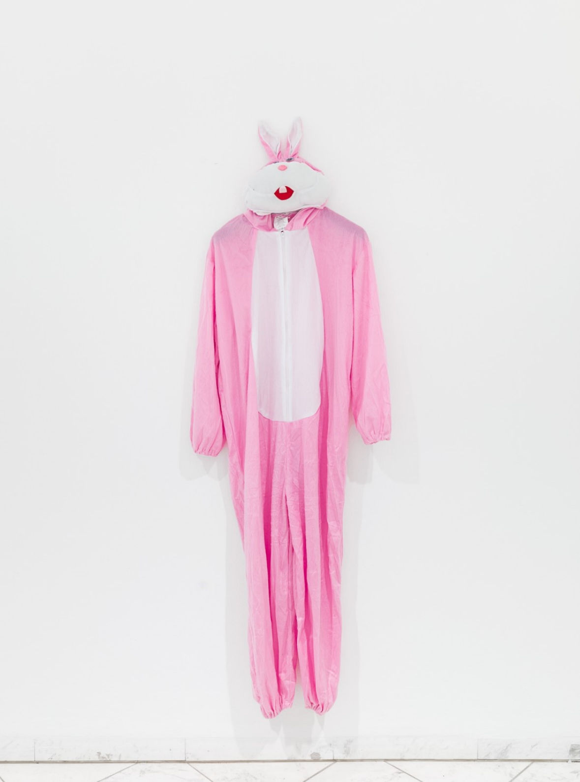
Pink Bunny Costume, 2022,

© Daniele Formica © VG Bild-Kunst, Bonn 2026