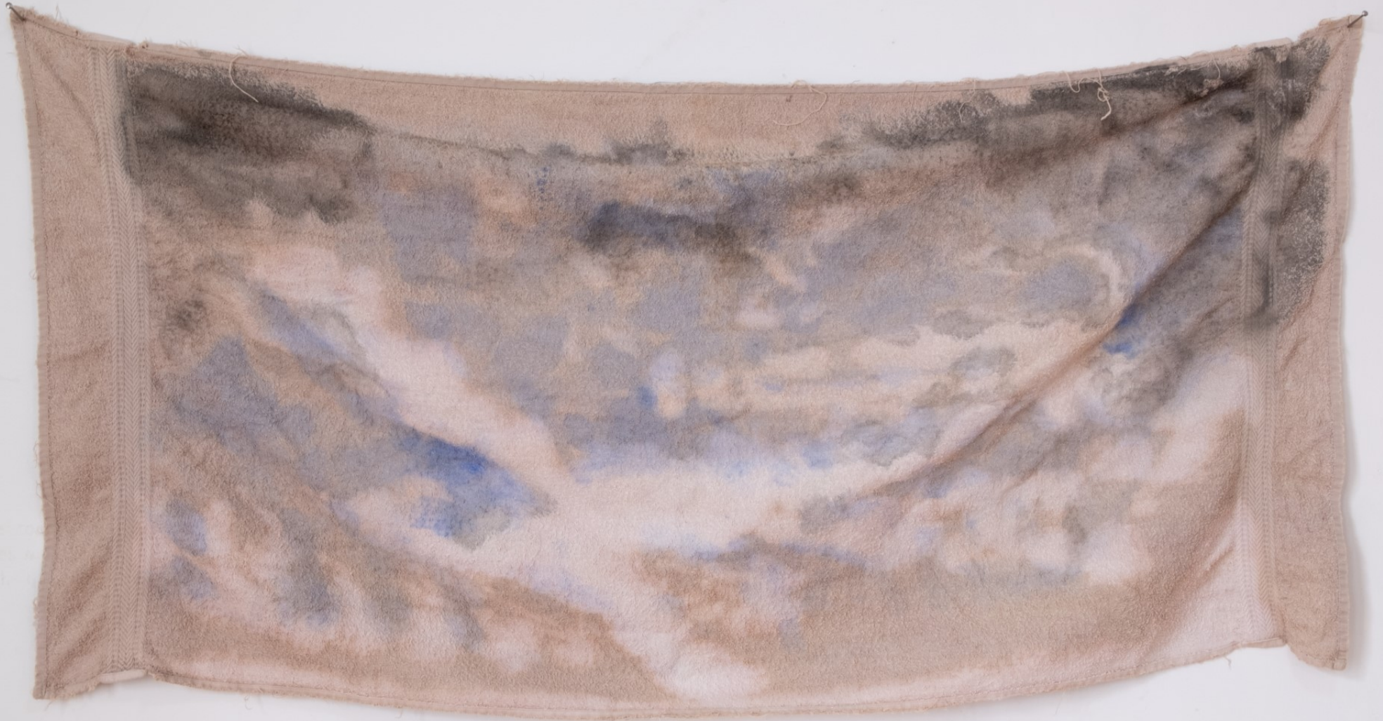
Dirty Towel, 2020, © Daniele Formica , photography Jeroen Desmalen