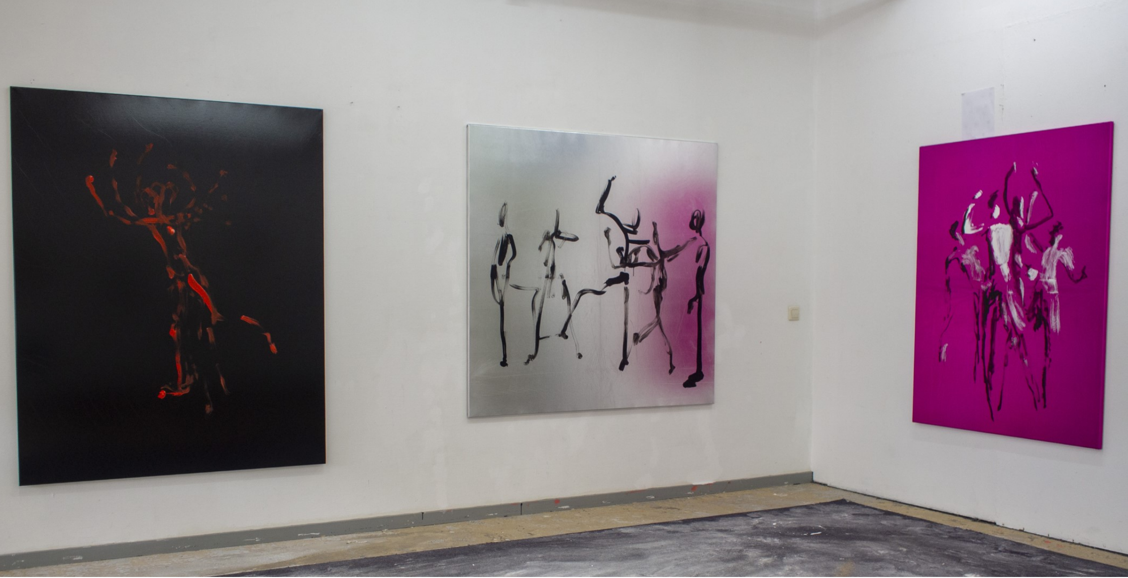
Reflections, 2025, © Daniele Formica