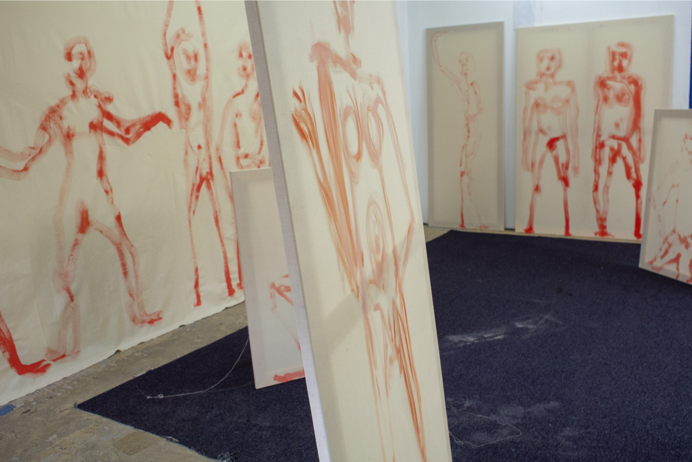
Poses, 2025, installation view, © Daniele Formica