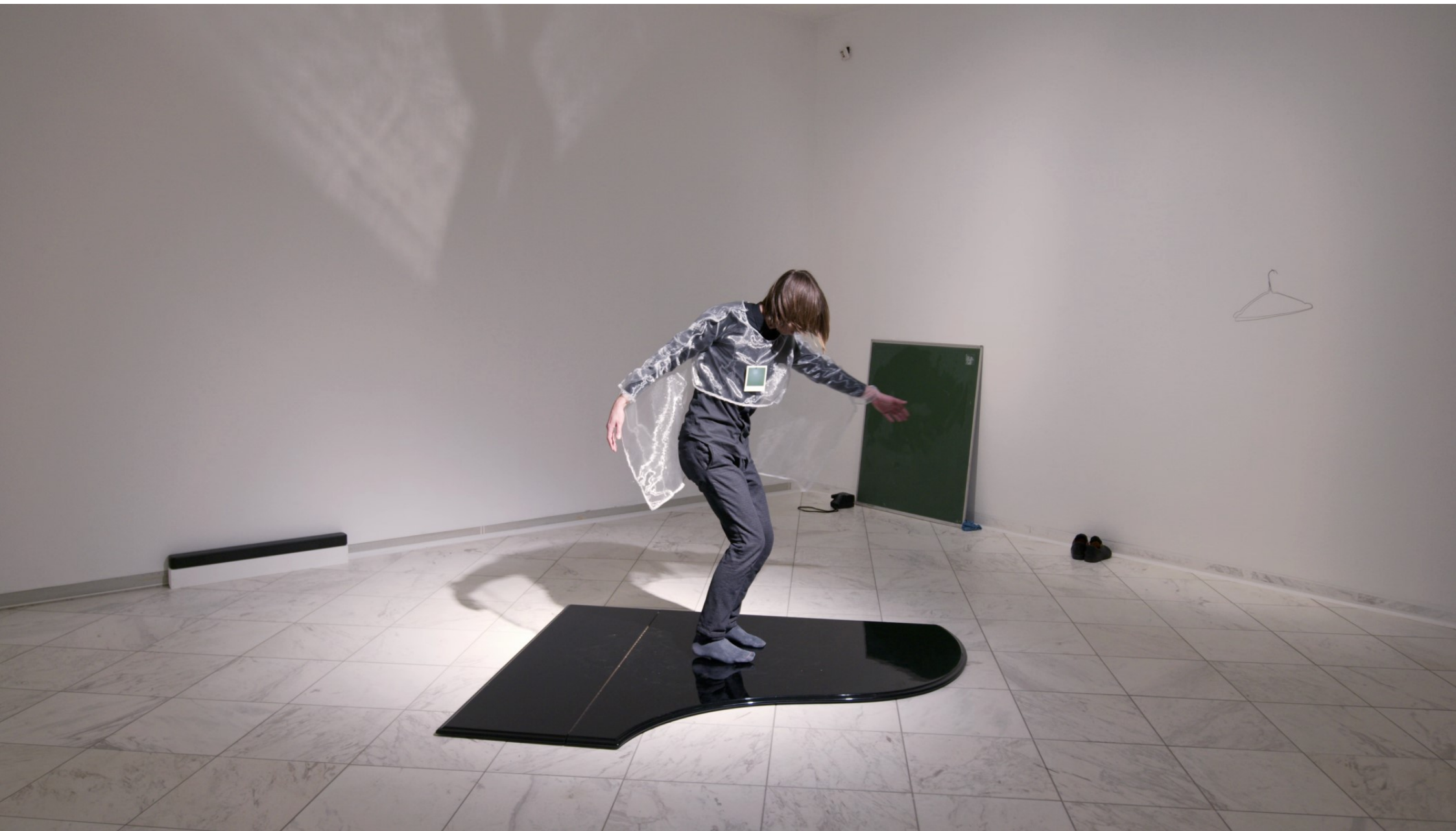
Dancing the Symphony: Evolution, Revolution, Volution, Spin! Spin! Spin! 2026, screenshot from Video-performance, © Daniele Formica