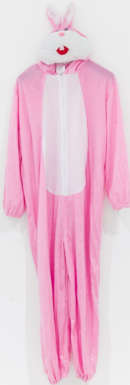
Pink Bunny Costume, 2022,

© Daniele Formica © VG Bild-Kunst, Bonn 2026