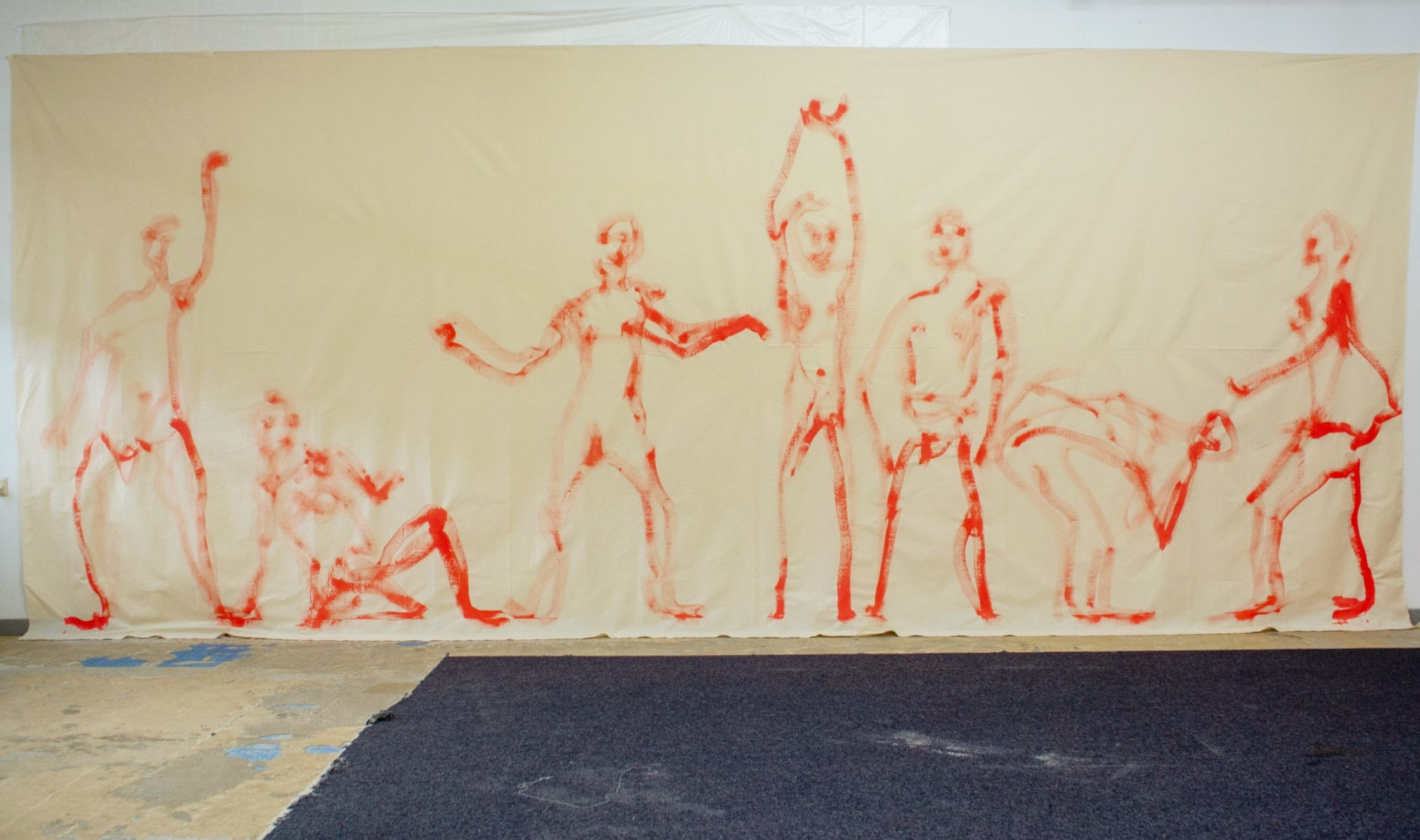
7 Poses, 2025, acrylic on raw cotton canvas, © Daniele Formica