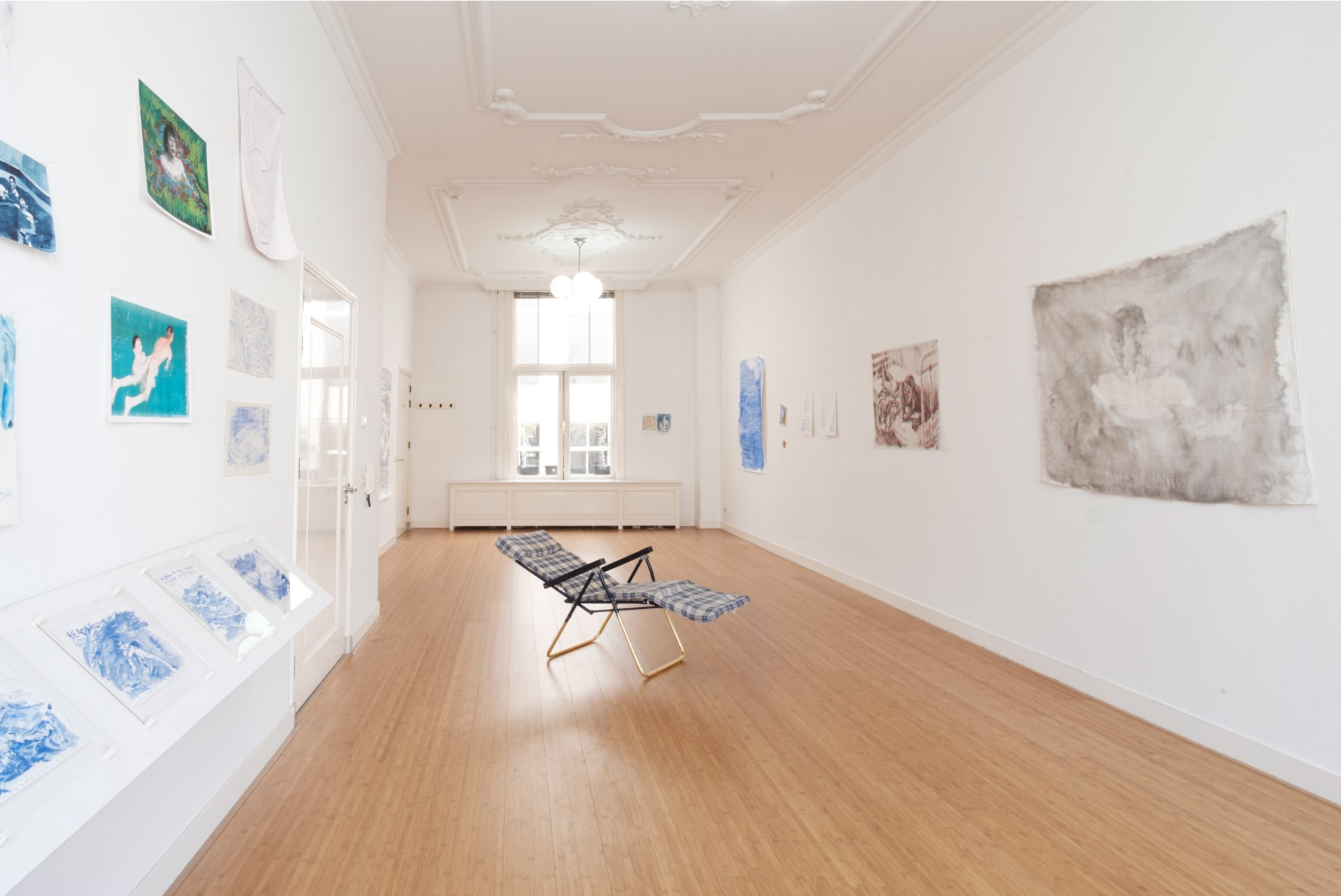
Boys by the pool, 2021, exhibition view, Ellen De Bruijne PROJECTS, Amsterdam, photographer: Jeroen Desmalen