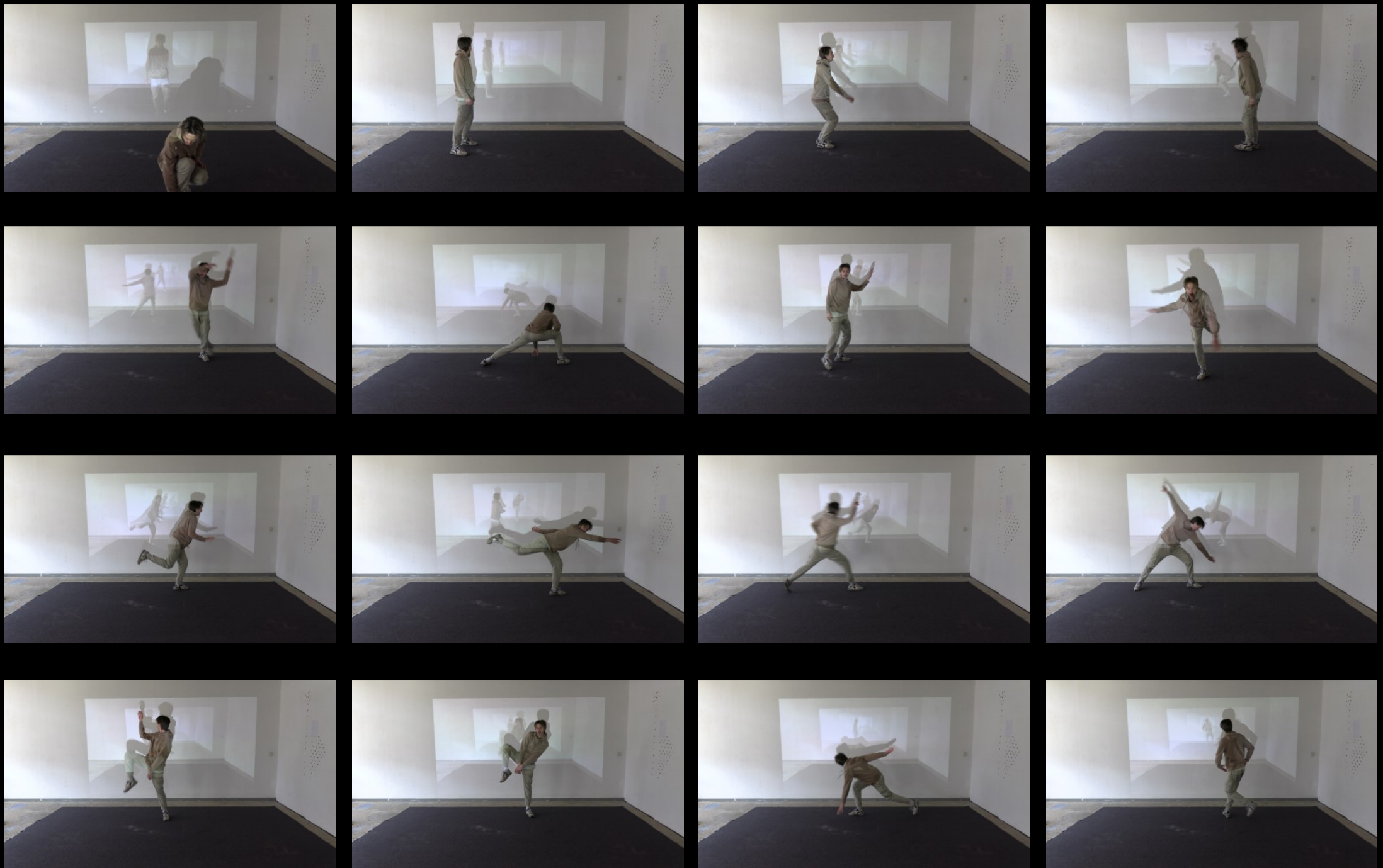
Daniele Formica, 10 x Rewriting Trio A, 2025, 00:06:10, Video, link: https://youtu.be/UHQiVBshQVw