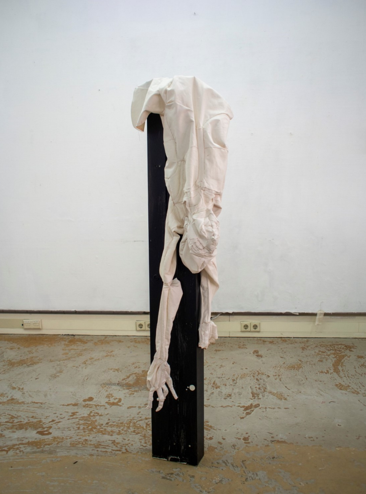
Sewn copy of myself, 2025, fabric, cotton thread, lightbox painted with black acrylic © Daniele Formica